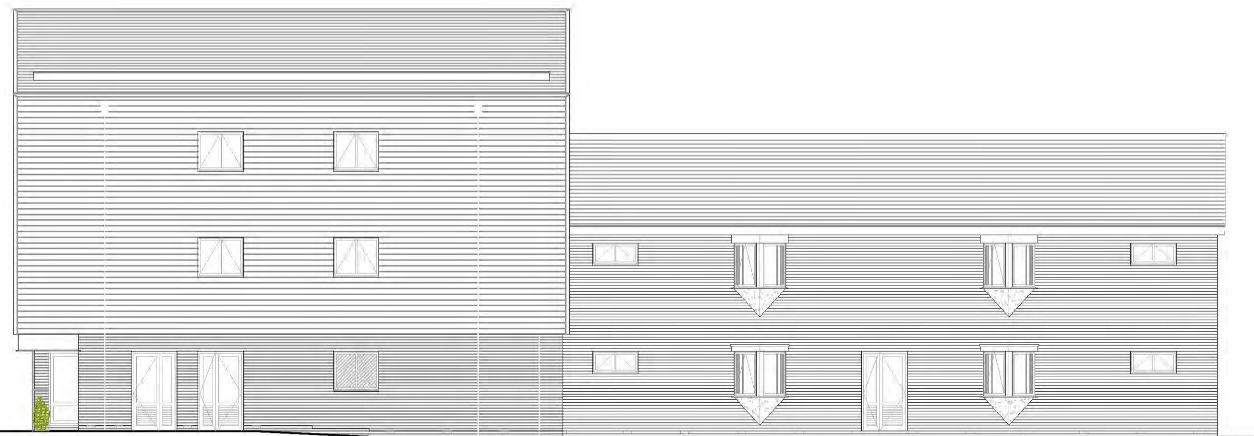
03 PROPOSED SIDE ELEVATION - NORTH Scale: 1:100