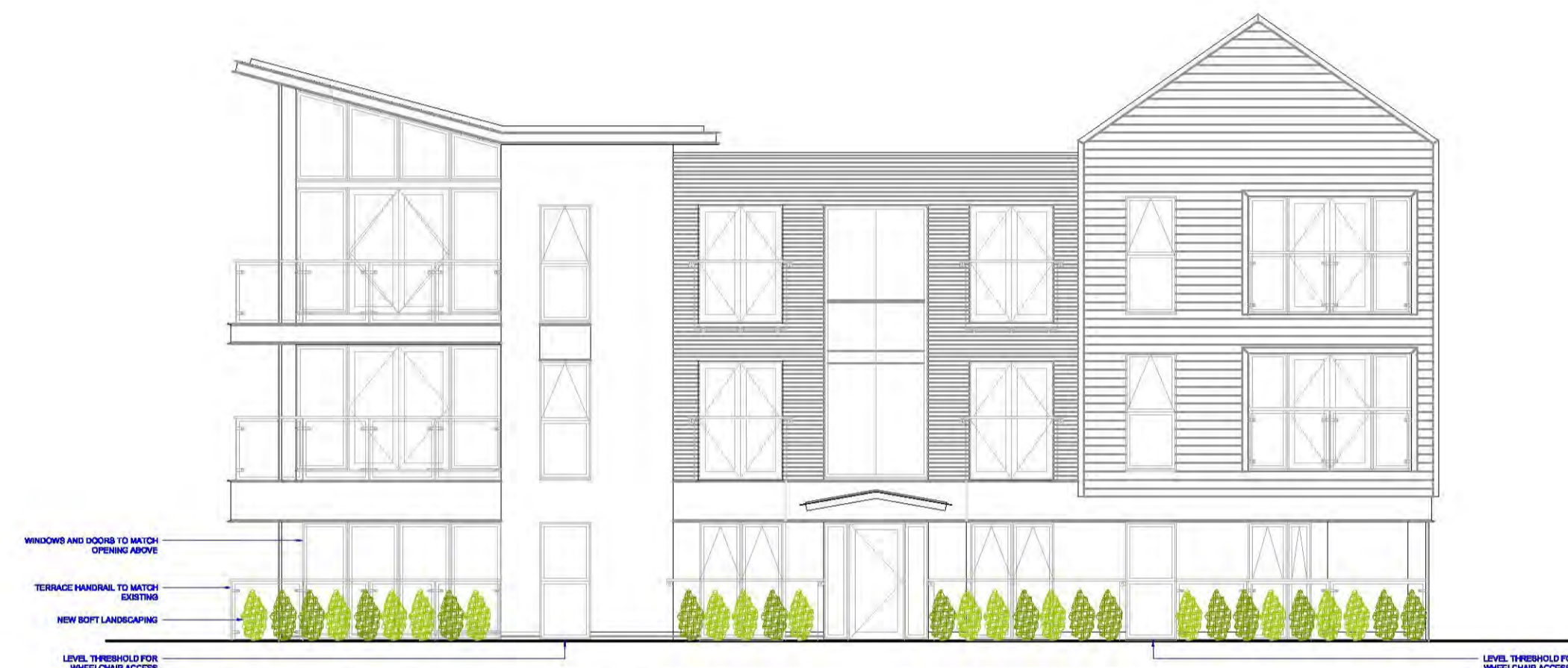
02 PROPOSED FRONT ELEVATION - EAST Scale: 1:100