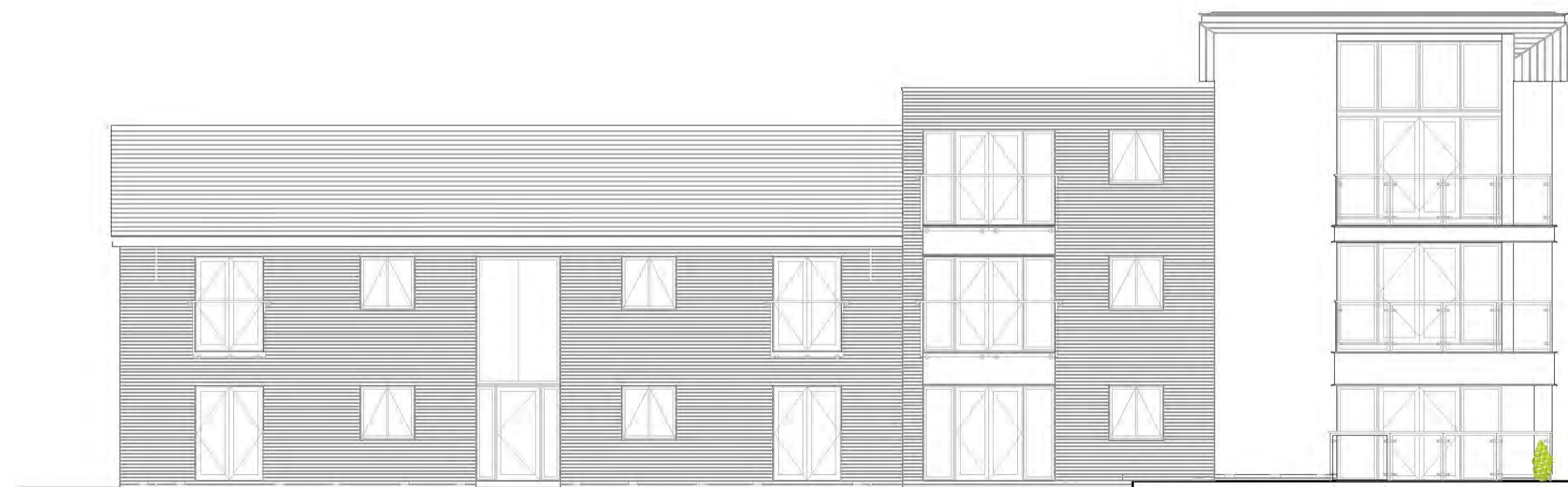
04 PROPOSED SIDE ELEVATION - SOUTH Scale: 1:100